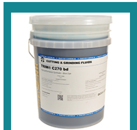
5-gallon pail SKU: C270BD/5 UPC-12: 641238001300