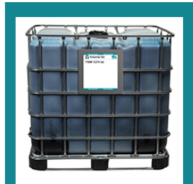
270-gallon tote SKU: C270BD/NR270P UPC-12: 641238034018