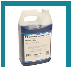
1-gallon jug SKU: C270BD/1 UPC-12: 641238066743