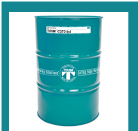
54-gallon drum SKU: C270BD/54 UPC-12: 641238001317